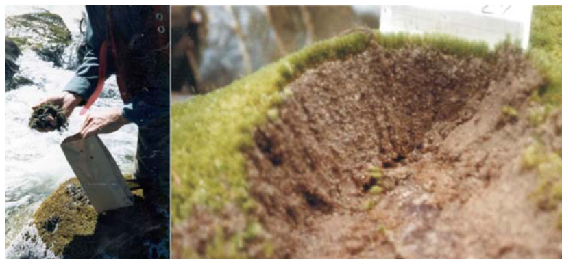
Figure 2. Collection of stream sediment material that has been trapped in moss mats growing in the active stream channel located in northern Vancouver Island.

To generate the new analytical information, a total of 3369 moss-mat sediment samples collected from Vancouver Island and quality-control samples were reanalyzed for 51 elements by aqua-regia digestion (0.5 g) ICP-MS/ICP-AES analysis, and Pt and Pd by a lead fire assay (up to 30 g) with ICP-MS finish. In co-operation with the BCGS, the original samples were recovered from the storage facility in Victoria. A total of 32 g of material was systematically removed from each storage vial, placed in labeled sample bags and delivered to ALS Canada Ltd. (North Vancouver). Due to an insufficient amount of material, 8 samples were not included as part of the ICPMS work and 32