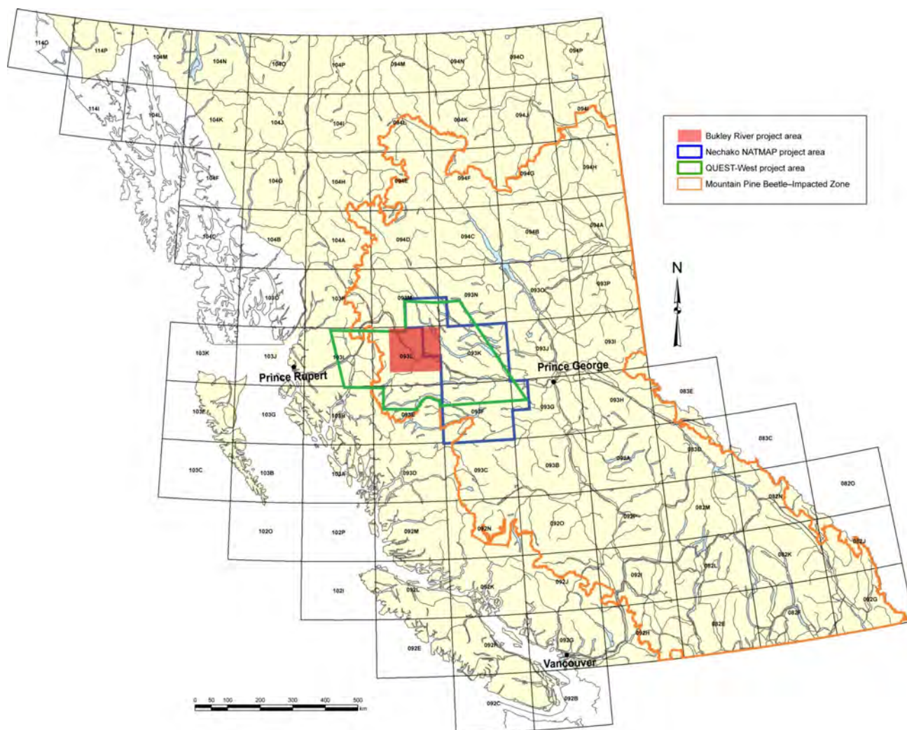
Figure 1. Location of study area in west-central British Columbia. The grid of 1:250 000 scale NTS map sheets is overlain on the map. The study area is delineated by the red shading.

topography that lies at an average elevation of 1200 m asl. The Bulkley River valley is bordered to the north and south by the Skeena and Hazelton mountains, respectively. The Skeena Mountains average 1600 m asl north of Houston and rise steeply to over 2100 m asl northwest of the town of Smithers (Figure 2). The Bulkley, Telkwa and Hudson Bay ranges of the Hazelton Mountains lie south of the valley and reach elevations over 2300 m asl. Glaciers and icefields occupy the north-facing cirques. The Morice and Telkwa River valleys drain these mountains to the Bulkley River, which flows north to the Skeena River and on to the Pacific Ocean. Babine Lake drains south and then east and lies within the Fraser River watershed. A low divide constructed of glacial sediments separates the Skeena River and Fraser River watersheds along the eastern boundary of the study area. In places, glacial meltwater streams have cut narrow channels across the divide. These meltwater streams drained glacial lakes that formed in the Bulkley