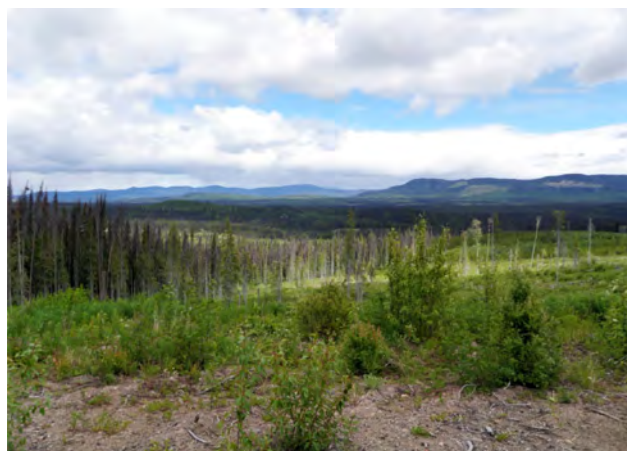
Figure 3. Subdued topography of the study area, west-central British Columbia. View is to the north towards the saddle that hosts the past-producing Equity Silver Ag-Cu-Au mine (central background).

The bedrock geology of the study area was first described and mapped by Hanson et al. (1942). More detailed mapping has since been completed by Tipper (1976), Church