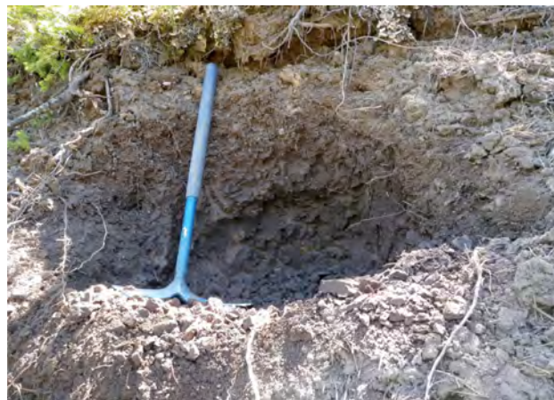
Figure 4. Clayey silt- to silt-rich, overconsolidated diamicton, interpreted as a basal till. The blocky appearance of this till is due to well developed vertical jointing and subhorizontal fissility. Pick for scale (65 cm).

The dominant surficial material found in the study area is an overconsolidated, light brown diamicton with a clayey silt-to silt-rich matrix, similar to that described by Ferbey (2010a, b). It is typically massive and matrix supported, and in many examples vertical jointing and subhorizontal