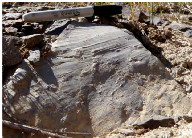
Figure 5. Well-preserved rat tails on an outcrop of Goosly Lake trachyandesite. The outcrop is located 3 km southeast of the Equity Silver minesite, on a southeastern aspect slope. Orientations of these rat tails indicated ice flow towards 272°. Pen for scale (14 cm).

Approximately 60 km southwest of the study area, Ferbey and Levson (2001b) and Ferbey (2004) conducted a de-