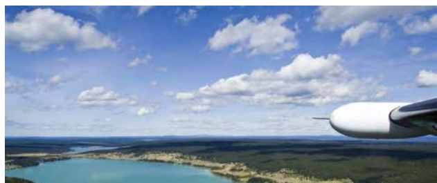
Figure 3. Relatively flat topography in the northern part of the survey area near 100 Mile House, southern British Columbia.