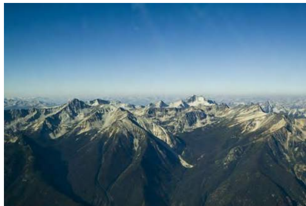
Figure 4. Mountainous terrain from the southern part of the survey area, southern British Columbia.