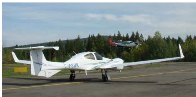
Figure 2. The two aircraft used in the QUEST-South airborne gravity survey, southern British Columbia, by Sander Geophysics Limited.