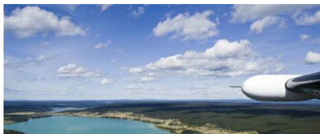
Figure 3. Relatively flat topography in the northern part of the survey area near 100 Mile House, southern British Columbia.