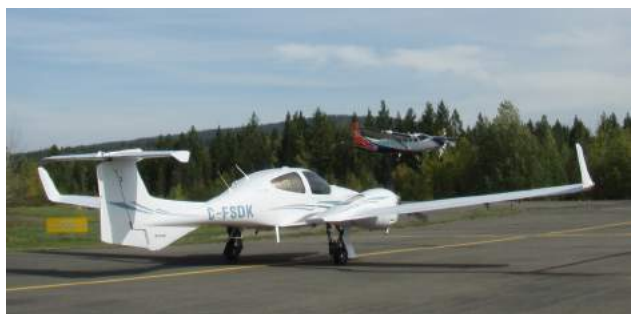
Figure 2. The two aircraft used in the QUEST-South airborne gravity survey, southern British Columbia, by Sander Geophysics Limited.