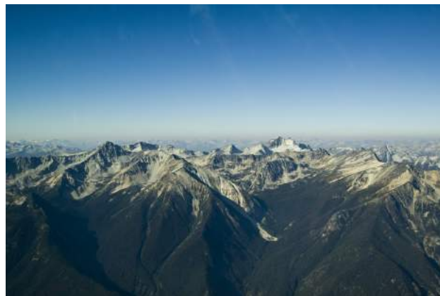
Figure 4. Mountainous terrain from the southern part of the survey area, southern British Columbia.