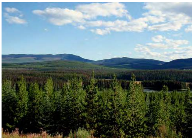
Figure 3. Subdued topography of the southwest corner of the study area, British Columbia. View is towards the east with Mosquito Hills in the background.

The Tahtsa Lake district lies within the Stikine Terrane, just east of the Coast Crystalline Belt (Monger et al., 1991). The west half of the study area is underlain mainly by Early to Middle Jurassic Hazelton Group volcanic and sedimentary rocks (MacIntyre, 1985). In places, these rocks are unconformably overlain by Middle to Late Jurassic Bowser Lake Group marine sedimentary rocks and Early Cretaceous Skeena Group turbidites and local basalt flows. These rocks are in turn unconformably overlain by felsic pyroclastic rocks, felsic flows and younger basaltic flows of the Early to Late Cretaceous Kasalka Group volcanic rocks. Many small- to medium-sized, Late Cretaceous to Early Tertiary stocks have intruded these volcanic piles and sedimentary packages (MacIntyre, 1985). The east half of the study area is dominantly underlain by Late Cretaceous to Tertiary Ootsa Lake Group and Eocene Endako Group volcanic rocks. There is a strong correlation between the location of intrusive rock types (in particular, porphyritic intrusions like those of the Late Cretaceous Bulkley suite) and the locations of Cu, Mo, Au, Pb, Zn and Ag mineralization (Carter, 1981; MacIntyre, 1985).