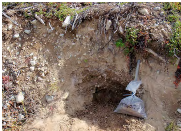
Figure 4. Typical sample site in a roadcut, west-central British Columbia. In the foreground is a 2–3 kg sample.

On the 2–3 kg samples, minor and trace-element analyses (37 elements) will be conducted on splits of the silt- plus