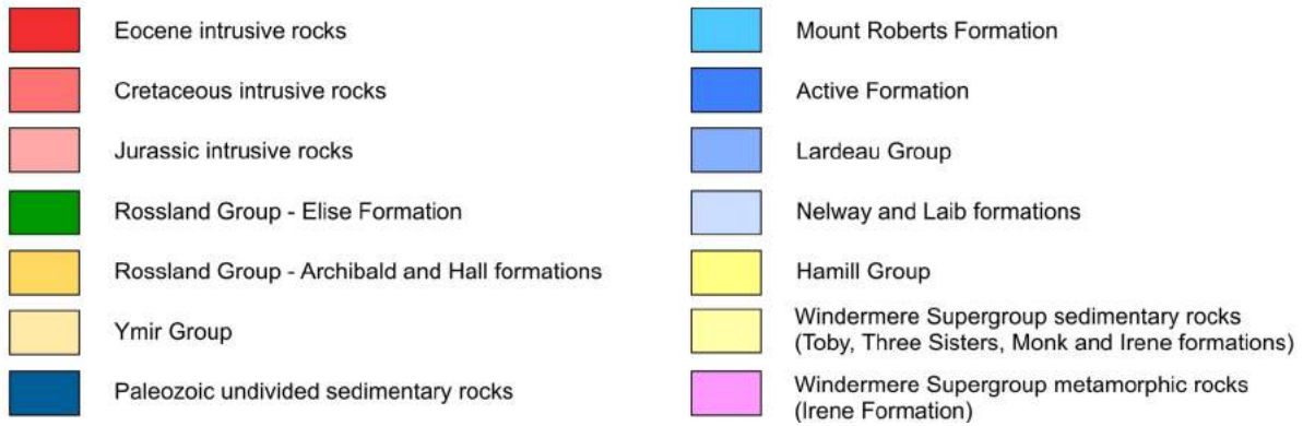
Figure 2. Area to be covered by Kootenay Arc electromagnetic-magnetic survey, with 100 m infill lines over Dajin Resources Corp. and Sultan Minerals Inc. claims.