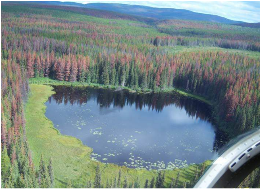
Figure 2. Typical lake sample site, located north of Mount Milligan, British Columbia.