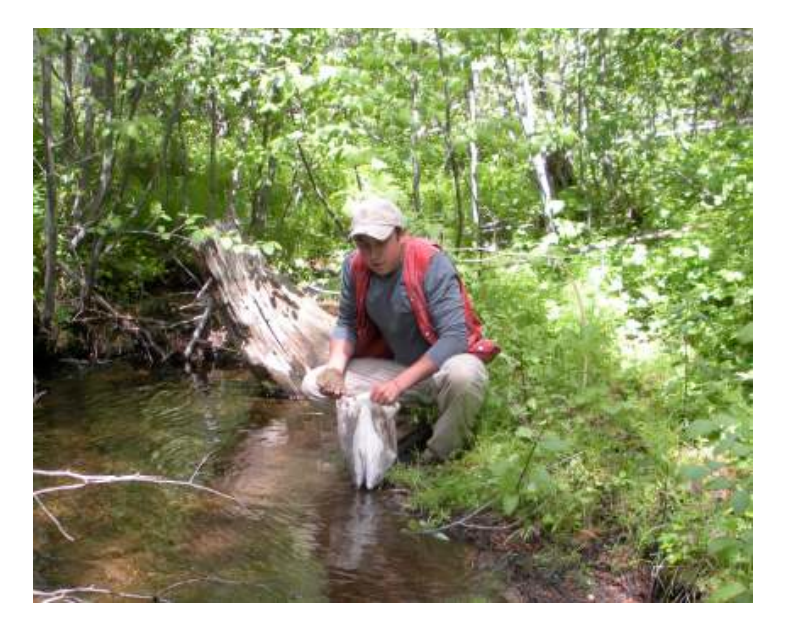
PHOTO 1. Collecting stream sediment samples for geochemical analysis.

Geophysics is essentially remote sensing of the properties or rocks in the ground, in this case the magnetic susceptibility of the rocks. Two surveys are planned, between Dease Lake and Iskut, and west of Telegraph Creek (see map on back). The surveys will be flown by helicopter and will operate out of local airports and exploration camps.